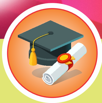
MERIT CUM MEANS SCHOLARSHIP