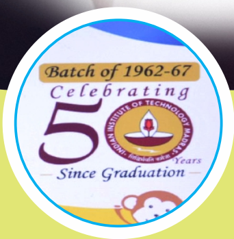
1967 BATCH REUNION FUND